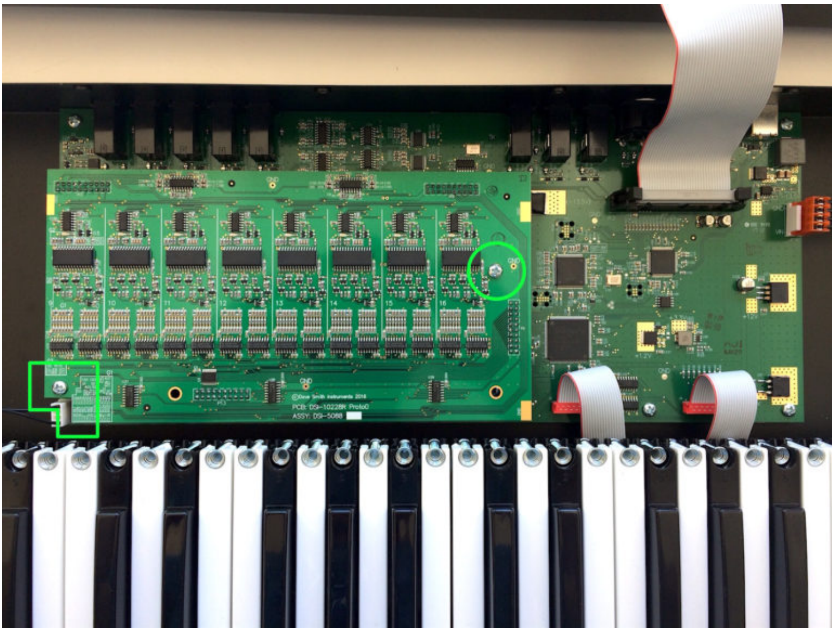
Rev2 Voice Expansion Board