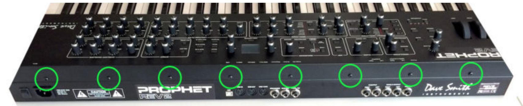
Rev2 Back Panel