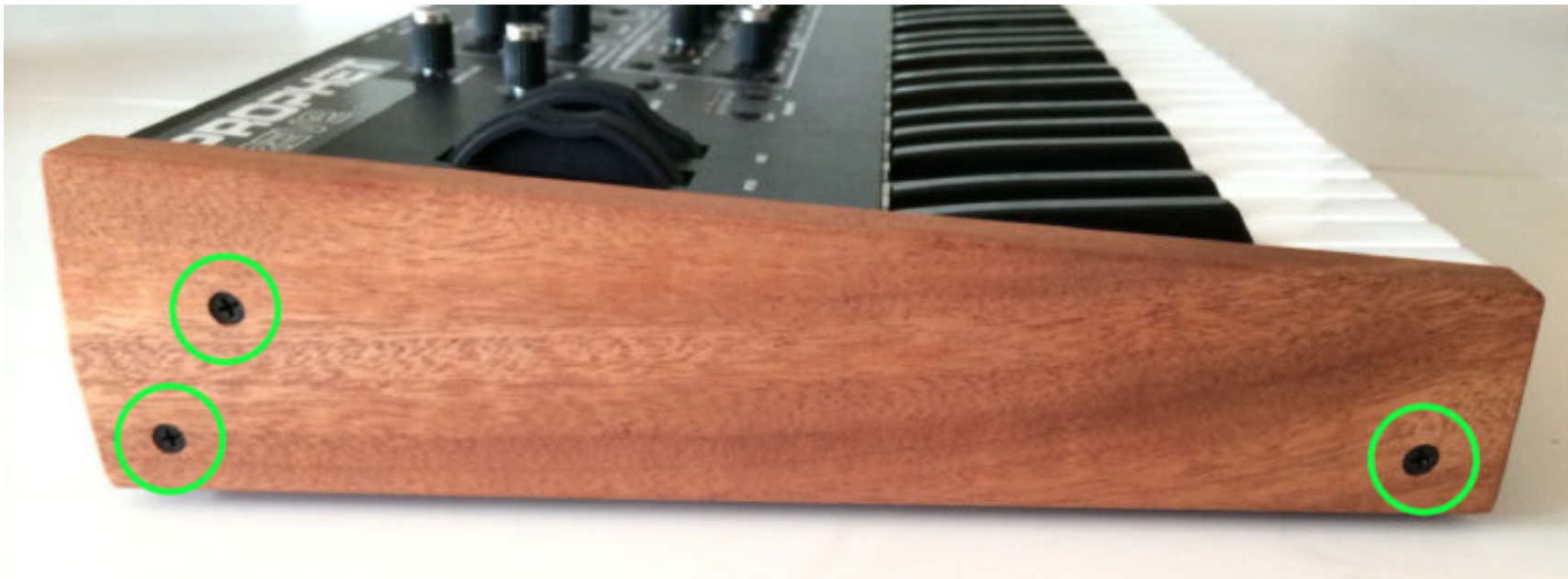
Left Wooden Side