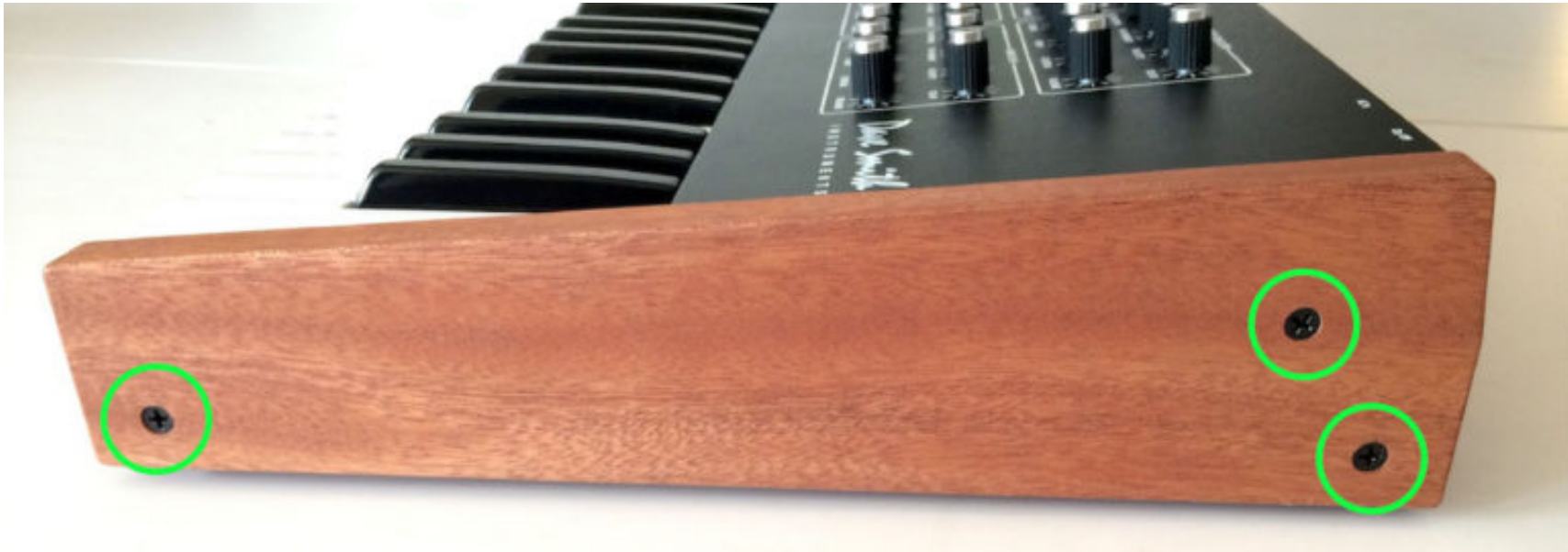
Right Wooden Side