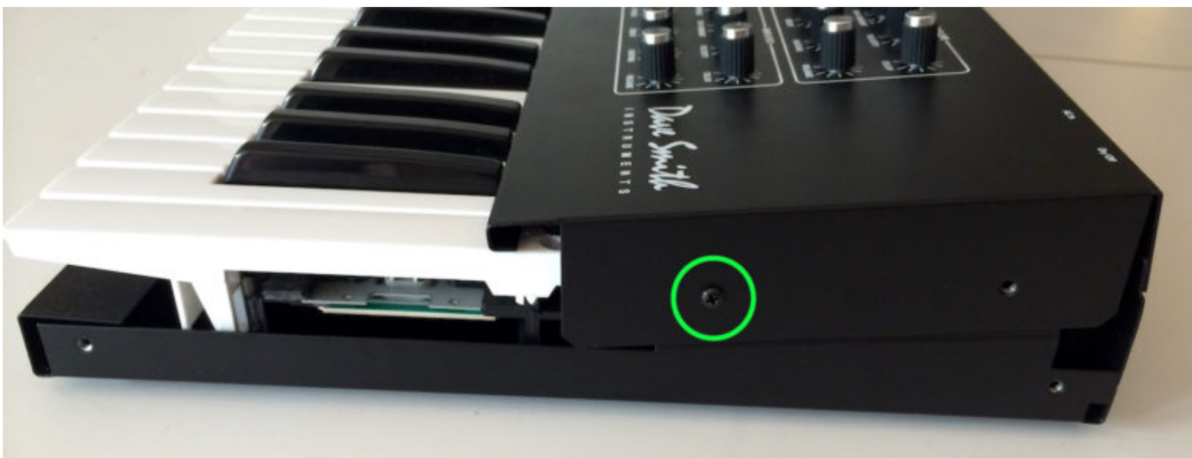
Right Side Screw