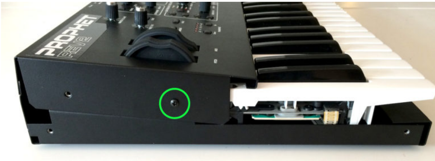
Left Side Screw