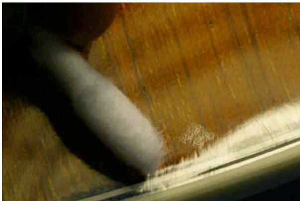
Testing the finish with acetone

You can check the finish by first looking at it. Nitro “checks” because of temperature and humidity variations rubs off and scratches quicker. Nitro also has a “yellow” hue which poly does not exhibit. However, if you cannot pin down what finish it is, take off the pickguard or get behind the neckplate, and use an ear swap lightly dipped in acetone. Because lacquer is removable by acetone, it will melt or breakdown when exposed to acetone. Poly will not react to the acetone, and will simply wipe off. Poly is only reactive to extreme heat. Therefore, a light swab of the acetone will show if it's nitro or not. Most refinishes will not use poly, so there is a good chance that a refinish will be from Guitar ReRanch.